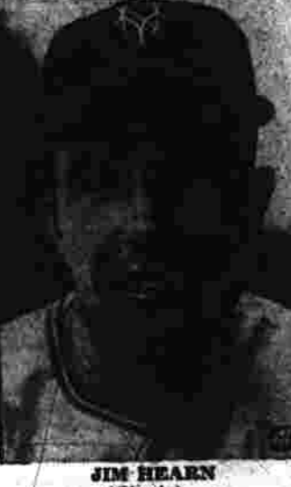
JIM HEARN (Giants)

FIRST INNING DODGERS Hearn's first pitch to Furlito was a high fast ball. Furlito went out on a high chopper to the mound. Hearn to Lockman on a close play.