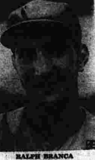
RALPH BRANCA (Brooklyn)