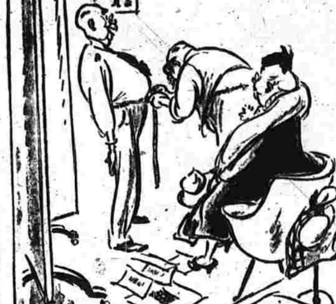
"How that I've retired I've finally got time to get what I've always wanted—a tailor-made business suit!"