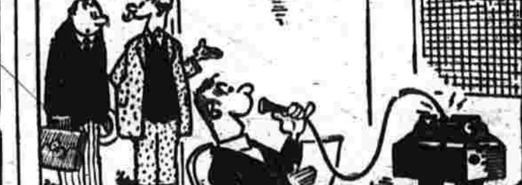
"He gets more zip in his sales letters since we got him that new dictation stand!"