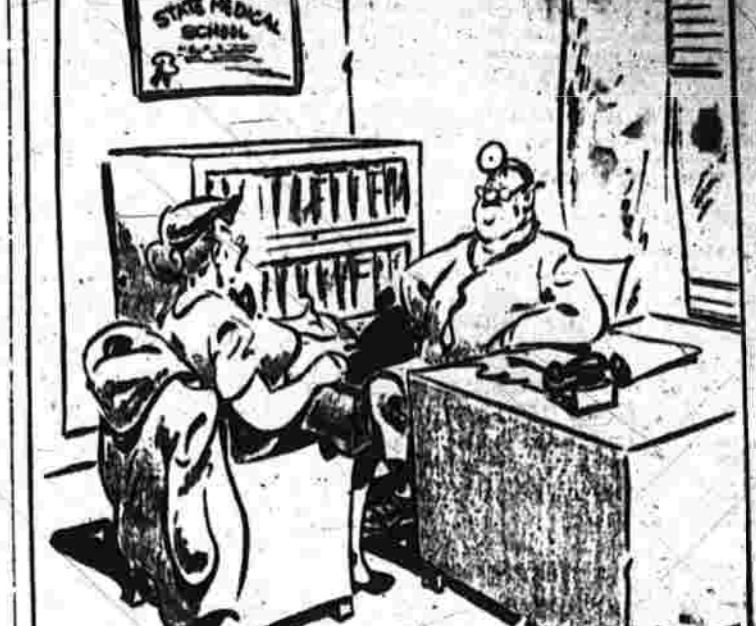
"Well, at least you could have said that this disease which is only in my mind was rare, exciting, interesting!"